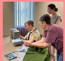
Learning From Others