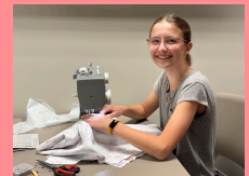
Sewing Machine Skills